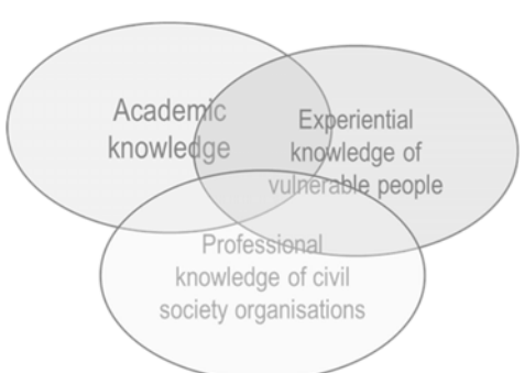
Figure 0.2 Merging of knowledge

This methodology was applied for the in-depth case study of water in Chapter 3. For this purpose, the RE-InVEST team joined forces with pre-existing dialogue processes at grassroots level, conducted by the Belgian Combat Poverty Service and (mainly) the Flemish federation of community work Samenlevings-opbouw Vlaanderen. We thank all parties for their active contribution to this report.